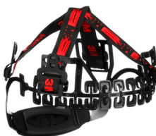
3M™ SecureFit™ H-Series Hard Hat Suspension Replacement