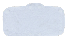
3M™ Hard Hat Terry Cloth Sweatband